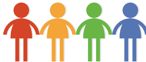
Responsibility (Virtue for September & February)