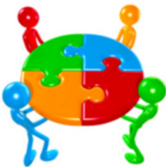
Collaboration (Virtue for November & April)