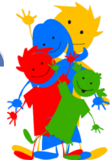
Respect (Virtue for October & March)