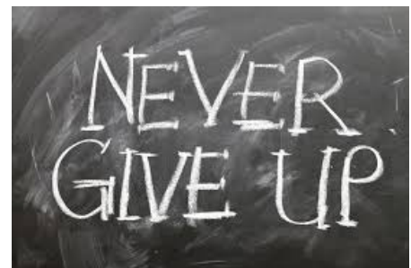
Perseverance (Virtue for January & June)