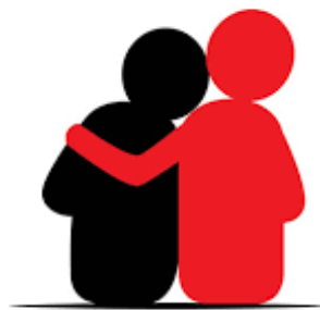
Empathy (Virtue for December & May)