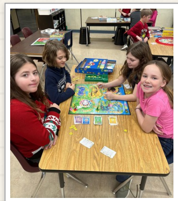
BOARD GAME AFTERNOON