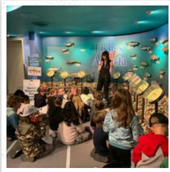
GR. 3 FIELD TRIP