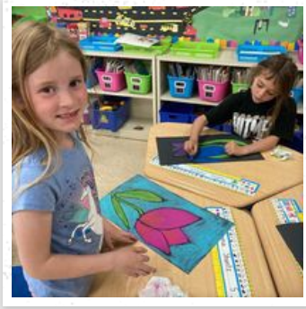
ARTISTS AT WORK