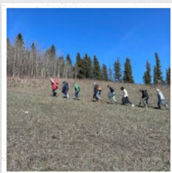
GR. 5 FIELD TRIP