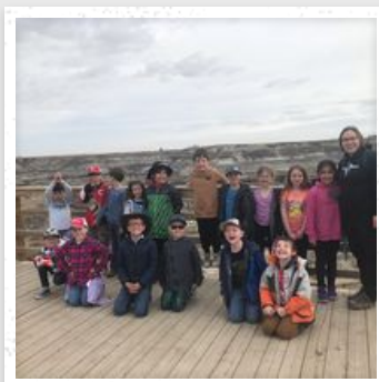
GR. 2 FIELD TRIP