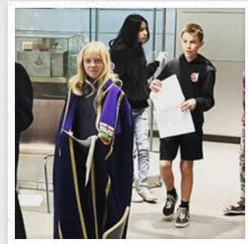
GR. 6 FIELD TRIP