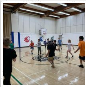
WESTIE'S SPORT START